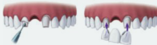
Fixed bridges may require the shaping or cutting down of adjacent healthy teeth.