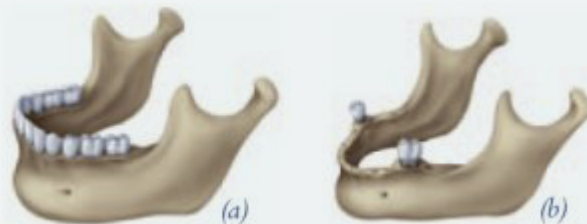
Bone is maintained by the presence of natural teeth or implants (a). Bone loss occurs with the loss of teeth (b).